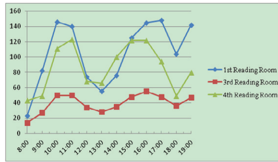
Fig.2. Distribution graph of reader number

In addition to the readers, the library staffs were surveyed. Of the total of 46 people aged 20 to 40 years old, more than 80% accepted fire-protection training possessing safety awareness.