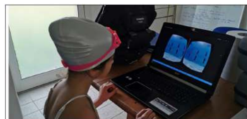
FIGURE 4 Self-confrontation with swimmer during lap-top viewing.

inspired by Peirce’s semeiotic (Skagestad, 2004). The course-of-experience framework is based on the notion of tetradic sign (Theureau, 2004). The tetradic sign is a triad that linked object–representamen–interpretant subjacent to the course of the experience unit. Poizat et al. (2022) defined the object like referred to the actor’s involvement in the situation, the representamen refers to perceptive, proprioceptive, or mnemonic judgment, and the interpretant refers to the activated (or established) knowledge that allows the actor to interpret the situation (Table 1). The course of experience unit refers