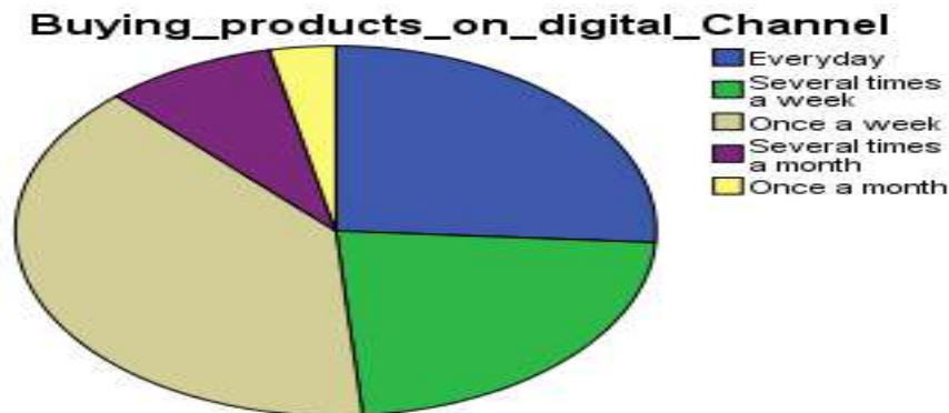
Figure 4.3: Buying products on digital Channel